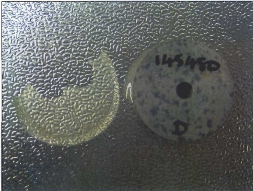
145480D Exhibiting Mixed Y/Z:Z (40:60) Failure