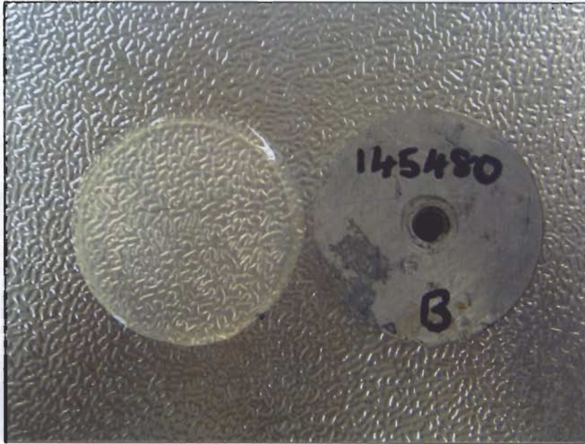
145480B Exhibiting Type Z Failure