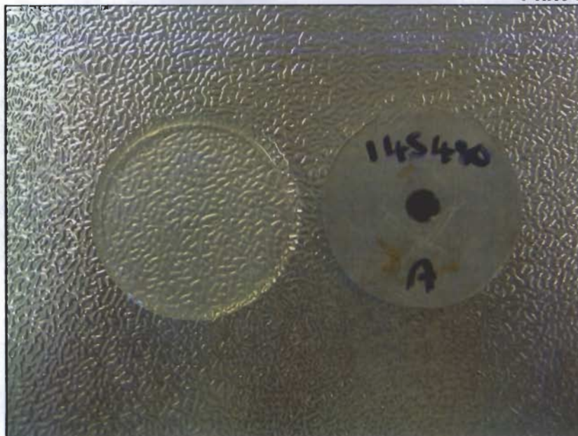
145480A Exhibiting Type Z Failure