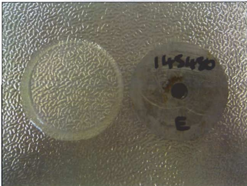
145480E Exhibiting Type Z Failure